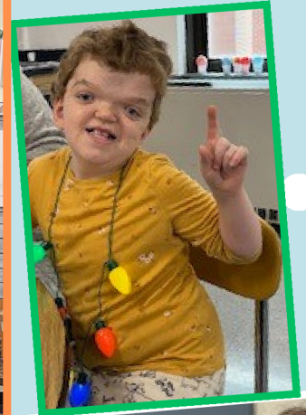
Holiday Spirit Week