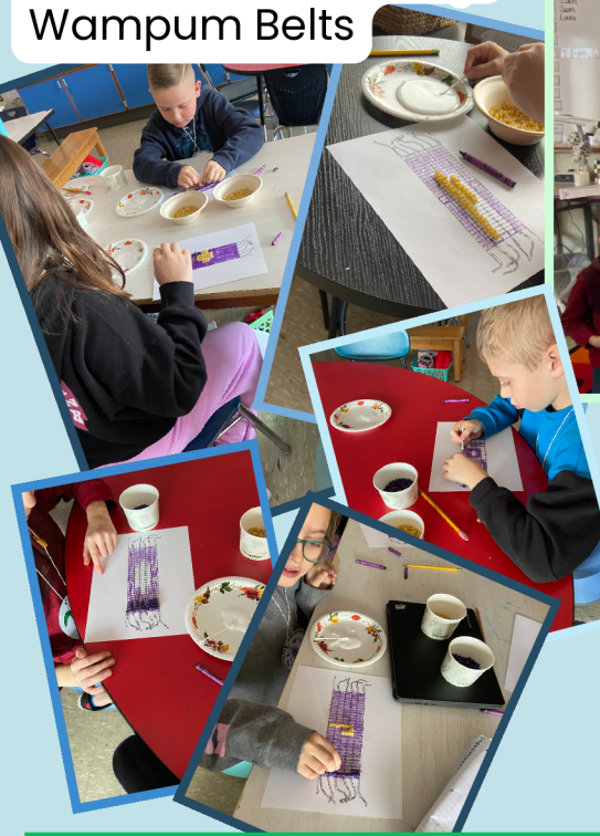
Haudenosaunee Day Wampum Belts